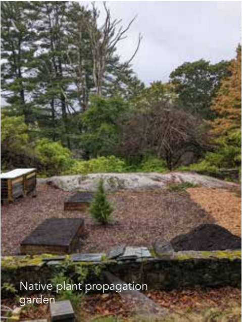
Native plant propagation garden