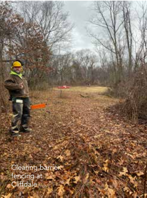
Clearing barrier fencing at Cliffdale