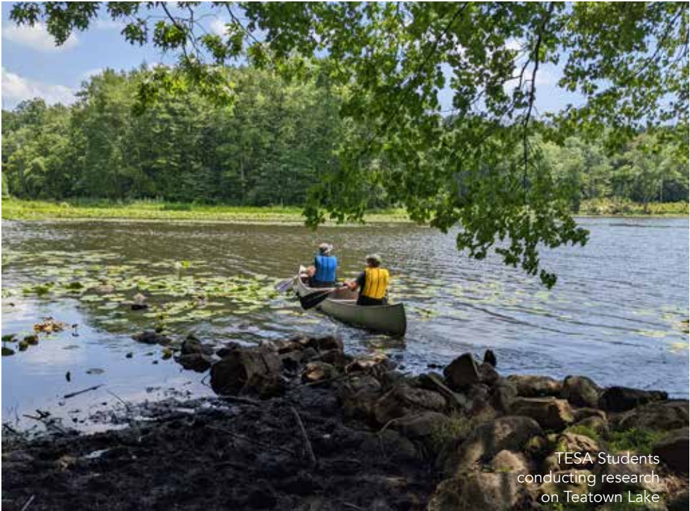
TESA Students conducting research on Teatown Lake