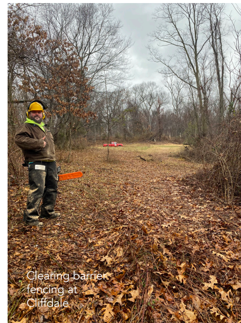
Clearing barrier fencing at Cliffdale