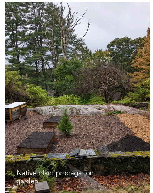
Native plant propagation garden