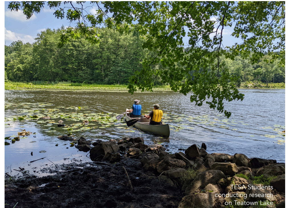
TESA Students conducting research on Teatown Lake

Native plant propagation will allow us to expand our restoration work, increasing the volume of plant material we can source with the added benefit of including Teatown-specific natives in our planting plans. We built four raised beds and two composting bins out of upcycled materials to create this new space.