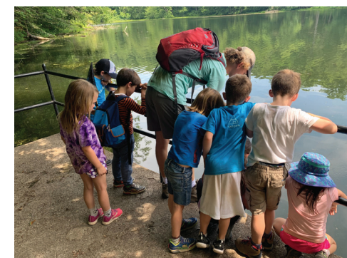
Bottom right: Summer Camp Trekkers at Vernay Lake