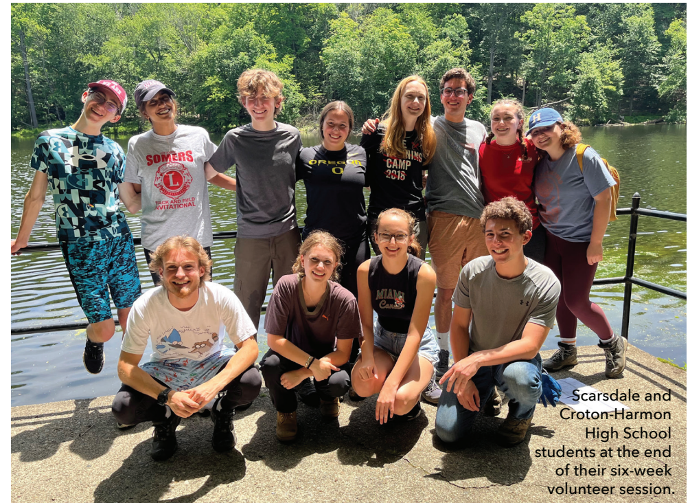
Scarsdale and Croton-Harmon High School students at the end of their six-week volunteer session.

In a follow-up to past work at Teatown, we launched the Teatown Turtle Study to determine the size of turtle populations in Teatown Lake. In two months, we caught, marked, and released 38 turtles from three different species for future study. The three species were the Common Snapping Turtle (17), Red Eared Slider (3), and Painted Turtle (18). Future captures of these already-marked individuals will allow us to estimate the exact size of the population of each species.