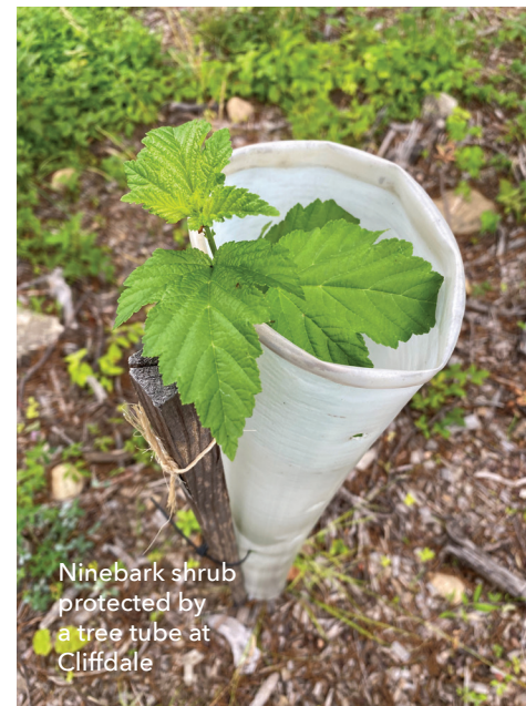
Ninebark shrub protected by a tree tube at Cliffdale