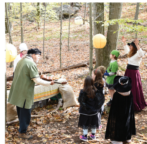
Above: A group of children exploring the Enchanted Forest