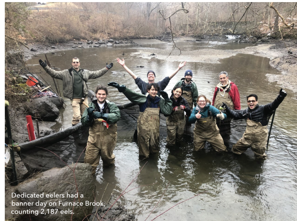
Dedicated eelers had a banner day on Furnace Brook, counting 2,187 eels.

ELLA members and the general public participated together in a two-part in-depth “boot camp,” run by energy expert Lindsay Audin of Croton. Boot campers explored how to prioritize and evaluate meaningful climate projects for the greatest impact, focusing on action at both the individual and community levels. These sessions took place via Zoom.