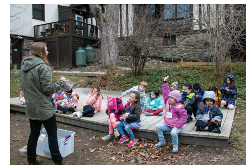
Top right: Students in Grow Wild