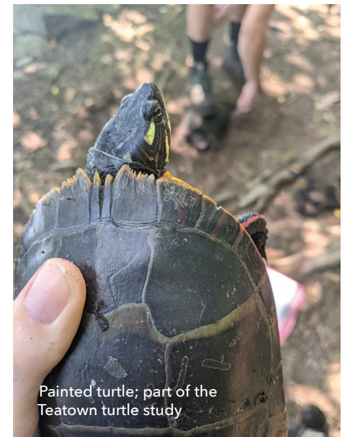
Painted turtle; part of the Teatown turtle study