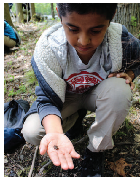
Top and bottom left: Students searching for critters in Teatown Lake