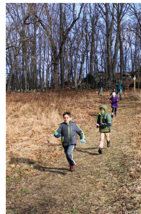
Bottom right: Teatown's mini-camp