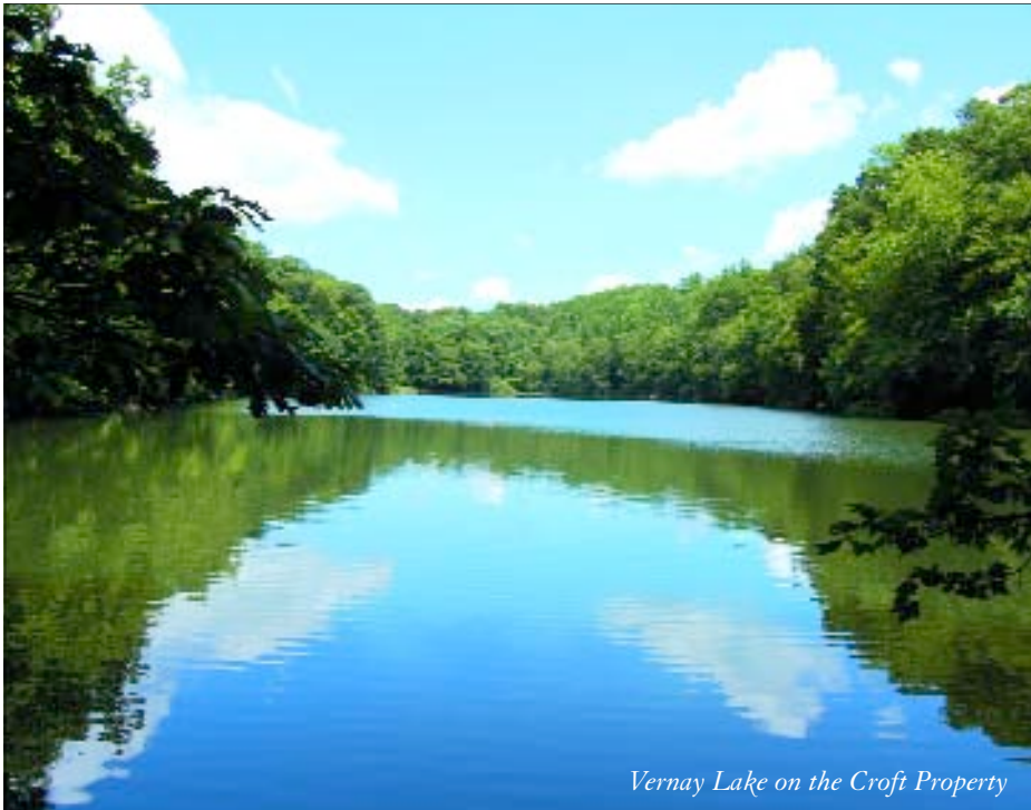
Vernay Lake on the Croft Property

Teatown and the community have an opportunity to protect a 59-acre parcel of open space, including the beautiful nine-acre Vernay Lake, that lies within the heart of Teatown. This once in a lifetime opportunity will only be possible by bringing together a team of individuals, organizations, and government agencies. Teatown already has support from several key individuals, environmental groups and government officials. Now we need your help!